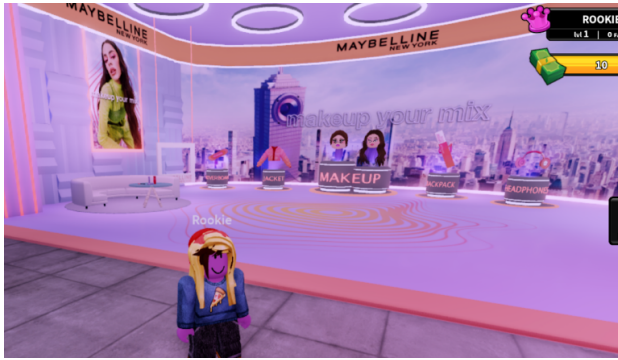
Fig. 4. Advergames : Maybelline NY Cosmetics advertisements (undisclosed) in a section of the Splash & Skate world.

advertising the company. These worlds run counter to much of the marketing for Roblox as a user-generated platform, made for and by kids. The TINA report describes advergimes by Stranger Things/Netflix, Hot Wheels, Fruit Loops, Walmart, Nike, and Vans, among others.