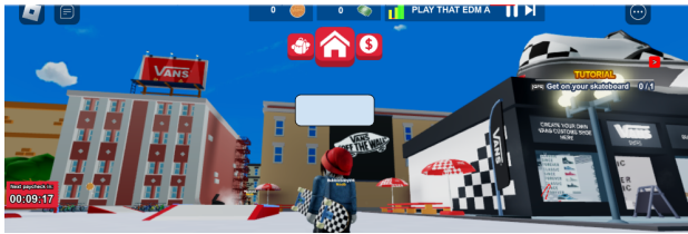
Fig. 3. Advergames : Screenshot from Vans World, where multiple billboards, meshes, and objects center around Vans (undisclosed) branding.