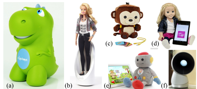
Figure 1. Example connected toys: (a) CogniToys Dino, (b) Hello Barbie, (c) SmartToy Monkey, (d) My friend Cayla, (e) TROBO the Storytelling Robot, (f) Jibo. Our study involved (a) and (b).

DOI: http://dx.doi.org/10.1145/3025453.3025735